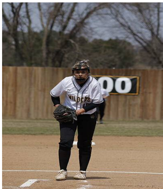
Wayne State College Softball Camps

This clinic will emphasize the basic skills needed for pitching. It is designed for the novice to advanced athlete. One of the many great qualities of this camp is the one on one instruction you will receive from the Wildcat staff. Pitchers are responsible for providing their own catchers. This clinic is a great way for young players to help them enhance their pitching game!